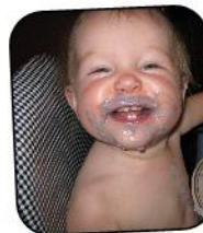
Macy 1 August 31st